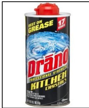
Sodium hydroxide (drain cleaner)