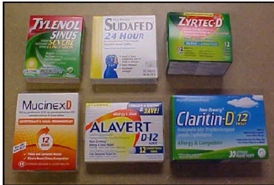
Pseudoephedrine or ephedrine based products and packaging