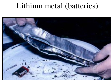
Lithium metal (batteries)