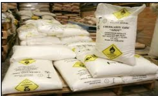
Ammonium nitrate / fertilizers